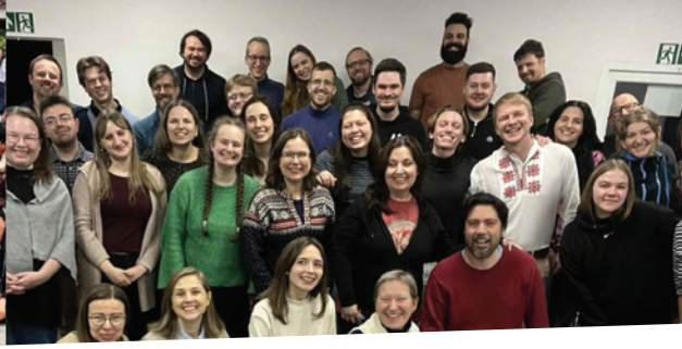
▲ Thank you for praying! IFES East Asia Student Ministry Consultation and IFES Europe Staff Consultation, both held in January.