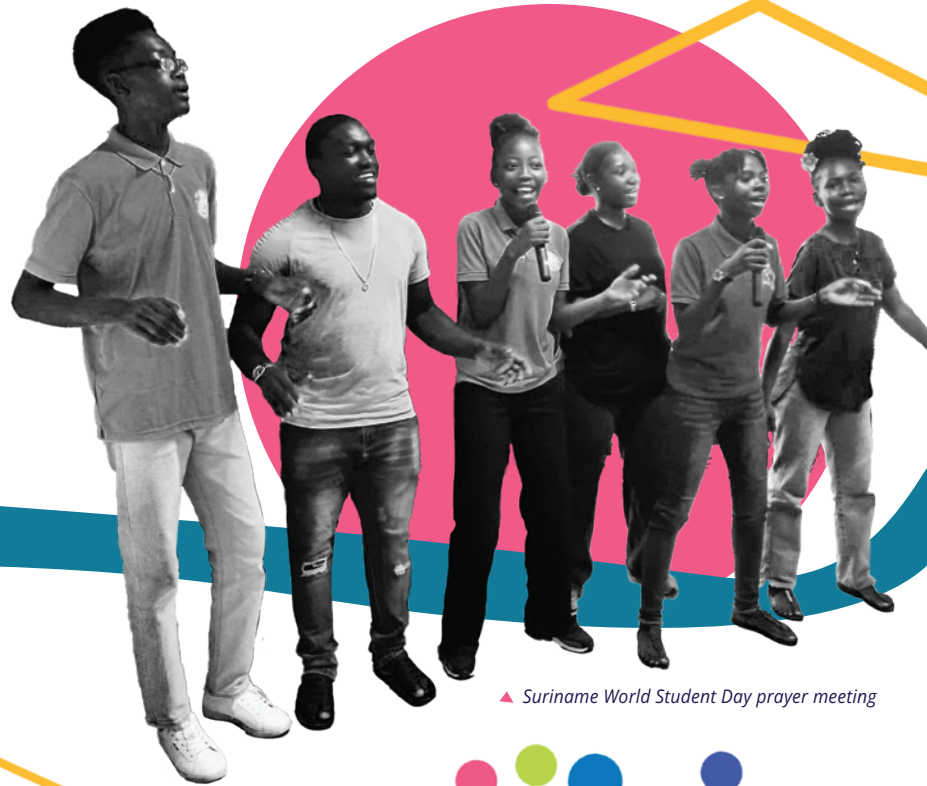
▲ Suriname World Student Day prayer meeting