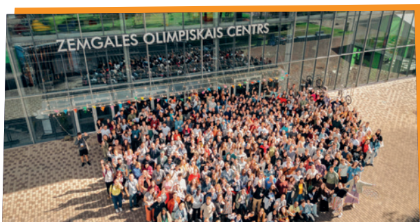
IFES Europe's European Student Festival in Latvia

"This is the beginning of a revival of students and not the end, particularly for [my central Asian country]."