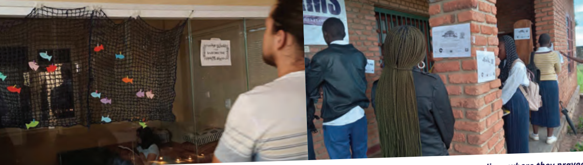
Students in Bulgaria and DR Congo set up prayer stations, including this Bulgarian one focused on evangelism, where they prayed for their friends