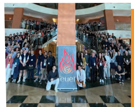
▲ FEUER Conference, November 2023