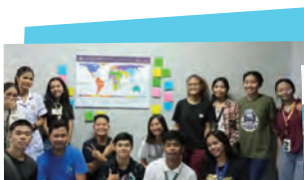
▲ Students in Sorsogon, Philippines held a prayer night

As we look back on a busy year for the IFES family, and forward to a new year of ministry we wanted to say a HUGE THANK YOU for all the ways you have supported IFES during 2023. Your prayers and gifts have enabled more students to hear about Jesus, more students, staff and volunteers to be trained, and allowed the offices which serve the frontline ministry to perform all the various practical functions which sustain campus work. As well as the many thousands of specific gifts for staff, movements and projects, the donations (including gifts in wills) made for ministry worldwide and where most needed allowed IFES to respond to situations and funding gaps which arose, including evangelism and ministry training, and ensuring that staff who struggle to raise their own support were able to continue in ministry. We praise God for each of you!