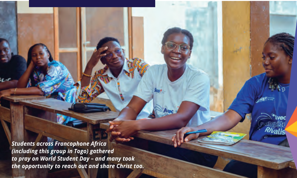
Students across Francophone Africa (including this group in Togo) gathered to pray on World Student Day - and many took the opportunity to reach out and share Christ too.