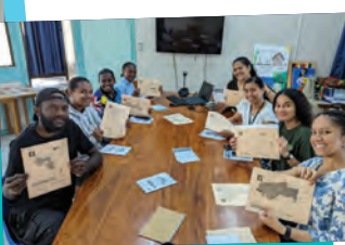
◀ Students in Vanuatu prayed using IFES maps.