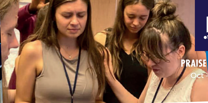
Prayer time at IFES Europe InterAction Debrief conference, June 2022