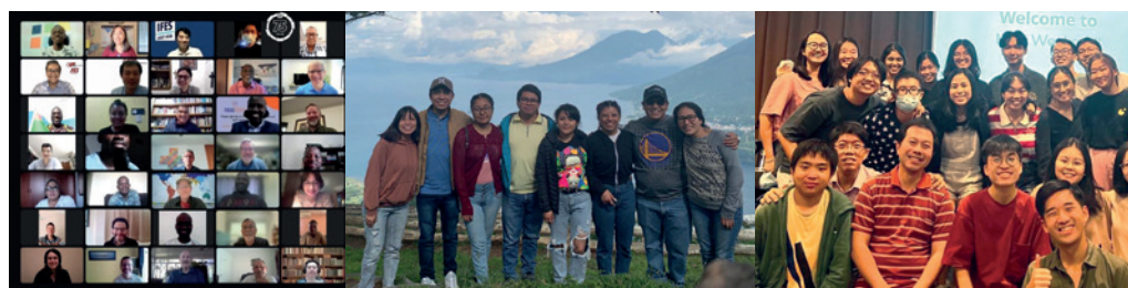
(L-R): Online 75th Anniversary Celebrations for leaders of IFES movements ; After so long online, GEU Guatemala staff and students were delighted to be able to meet in person again; FES Singapore National Student Council Handover Weekend, August 2022

Across Europe, pandemic restrictions made it hard for new students to get involved in groups, and many closed entirely. Pray that this latest intake of first years connect with groups in their cities or campuses and bring renewal and rebuilding of these groups. Pray too for those starting new groups. In Great