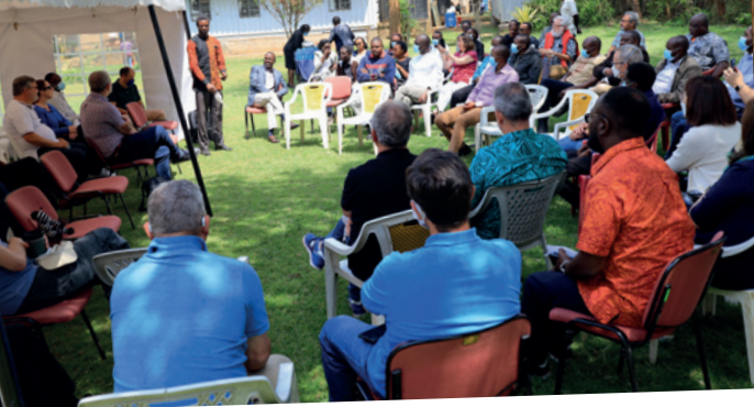
IFES senior staff meeting FOCUS Kenya staff, June 2022