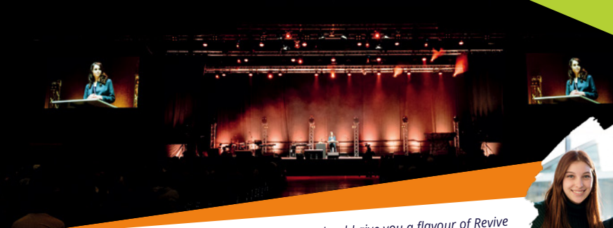
These photos should give you a flavour of Revive